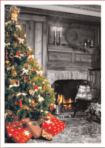
'Twas the night before . . . 174 x 125mm