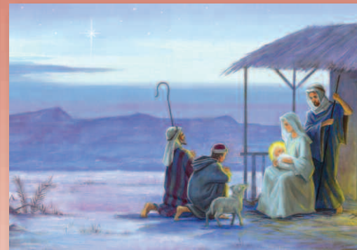
Shepherds visit Jesus 100 x 145mm

All cards are sold in packs of 10 with envelopes and have the following greeting: