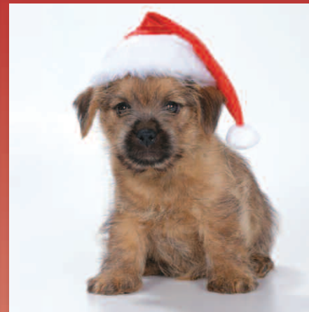
Going to the Party 125 x 125mm