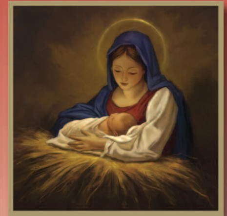
New Born Love 125 x 125mm