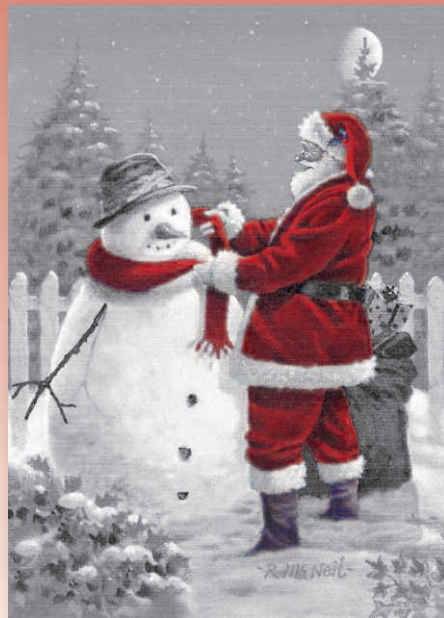
Santa 174 x 125mm